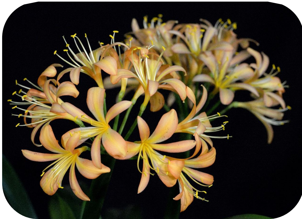
As per Clivia Society Web page description.

The important factor with the spider flower is that the ratio of the length of the tepal to the width of the tepal is 5:1 or greater. Any length or width of the tepals may be entered into the spider class, as long as the ratio of length to width is 5:1 or greater. (E.g. 20mm L; width 4mm)