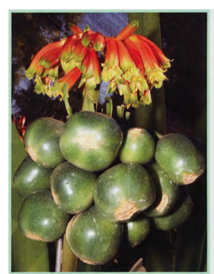
Berry Umbel 12 mnths

The covers illustrate a variety of forms of the plant. It also has a 'citrina' form, (previously illustrated on the back cover of Volume 16 Number 3, photos 1 & 2). ▼