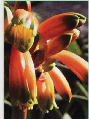
Base of Maxima plant Detail of Maxima flower