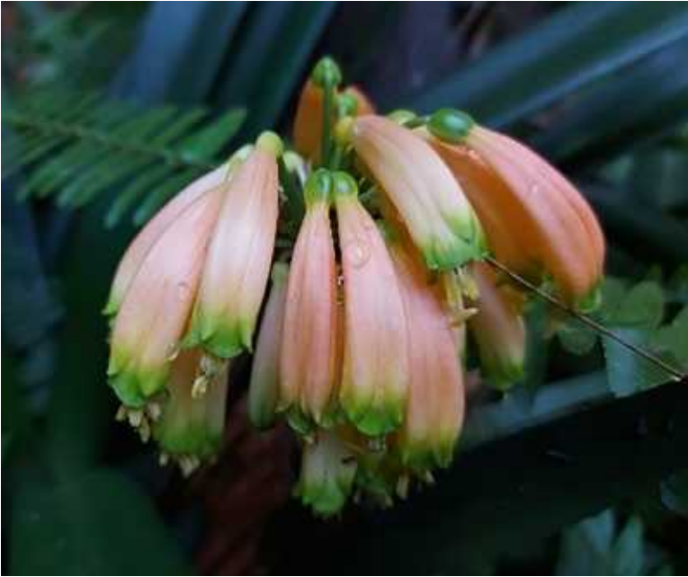
Left: Figure 4 Below: Figure 5