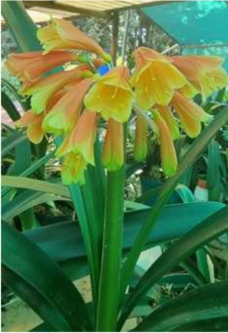
Hilton Atherstone – '#28 By Half-Moon'