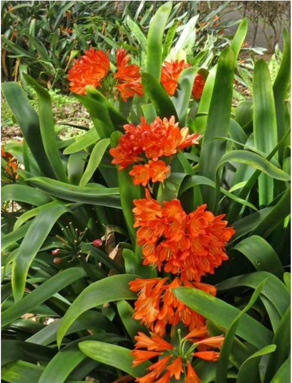
A clump of two plants with different forms.

rough edged leaves. However, I have never seen one with any notched leaf.