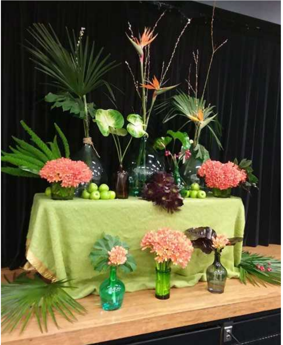
Figure 4 Floral Art 2018