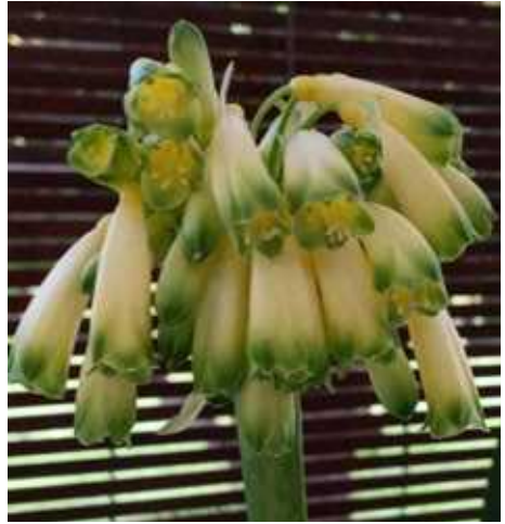
Daan Dekker – Yellow Caulescens – Eshowe