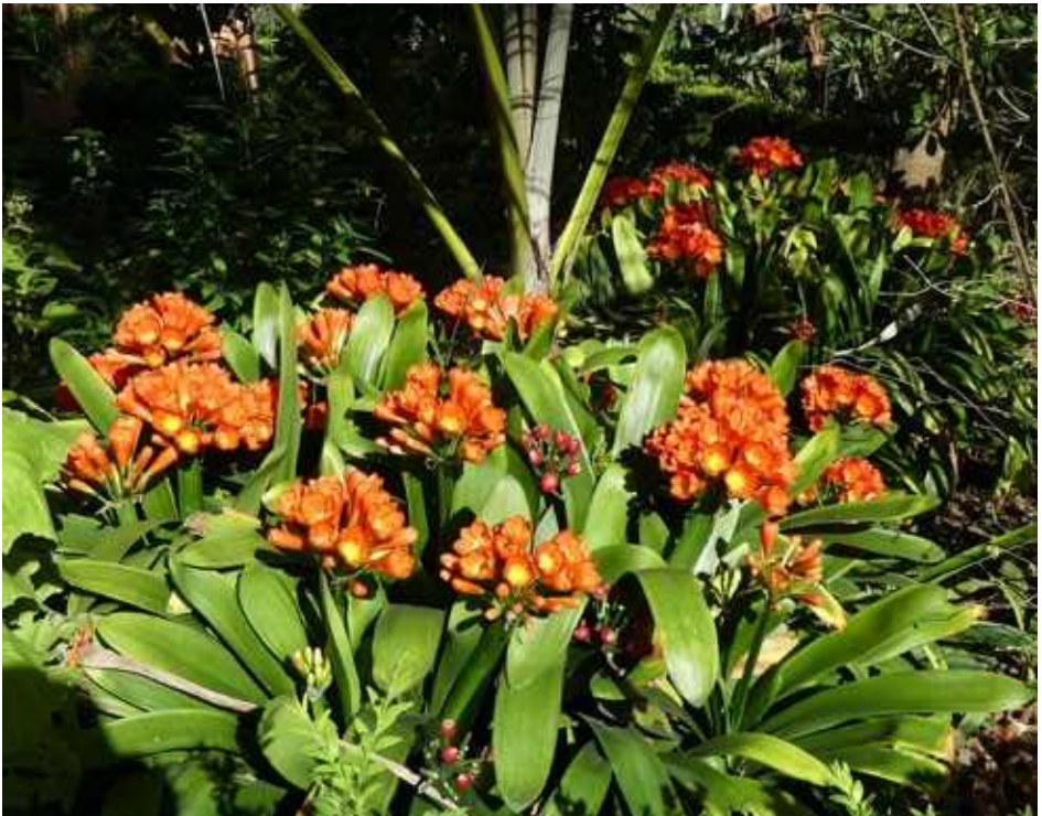
A group of mainly miniata forms.

Since that event, the miniata and nobilis crosses have flourishing in the garden as well on the rest