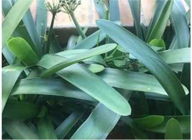
Leaf pattern of clivia plants in Majorca.

Clivia nobilis was the first Clivia species to be described in 1828 ( C. miniata only appeared 30 years later). C. nobilis plants were probably purloined by explorers and collectors from the Eastern Cape in the 1800's, taken to England and the onward to Europe.