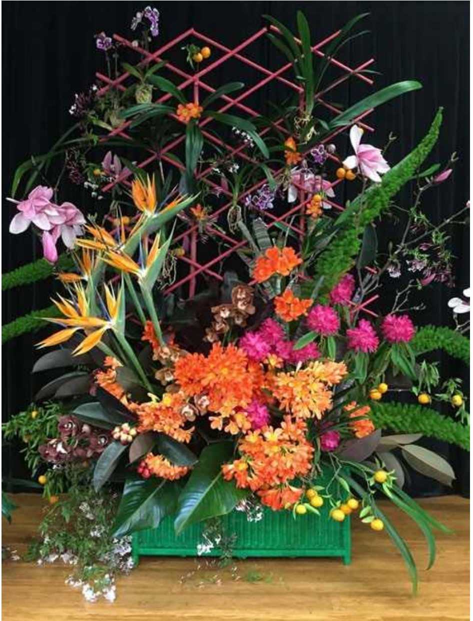
Figure 3 Floral Art 2017

way around), something that was impulse purchased, in a copper collecting period. The orange and yellow Clivia along with the other elements all seemed to work so well together