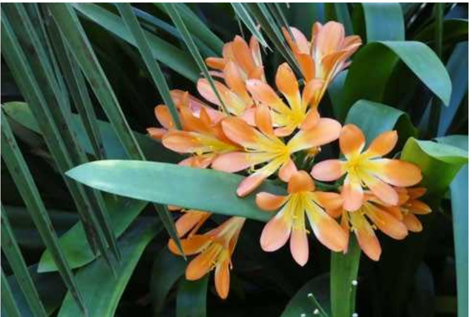
A possible miniata variety.