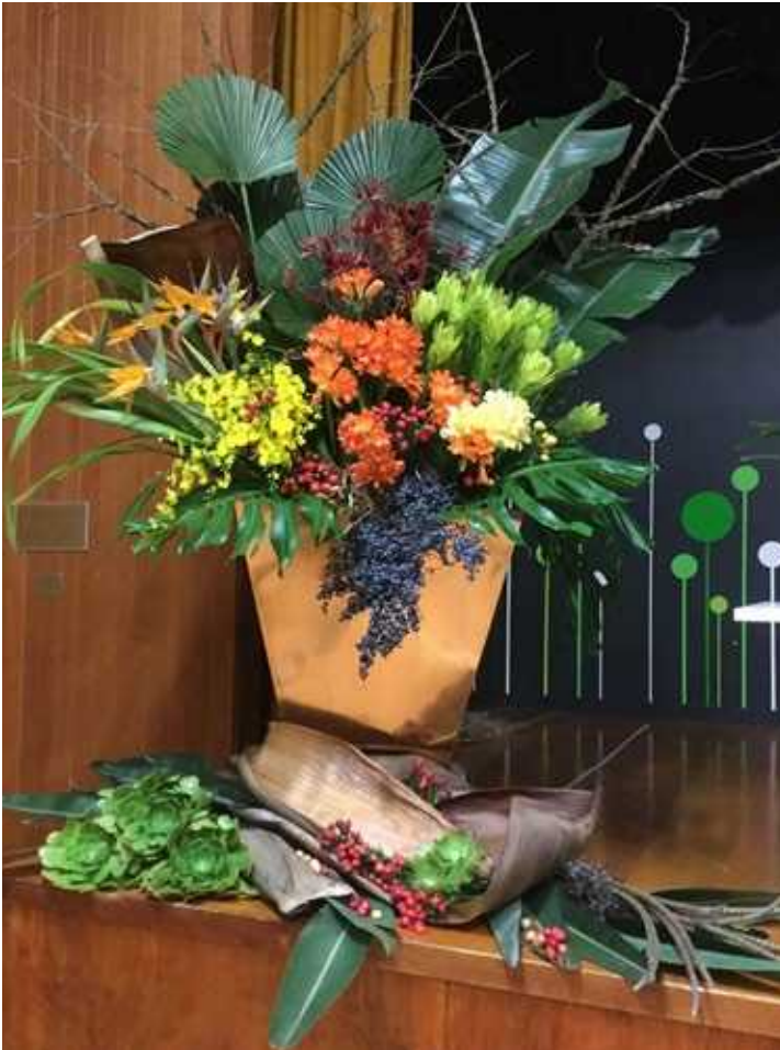
Figure 1 2015 Floral Art Display