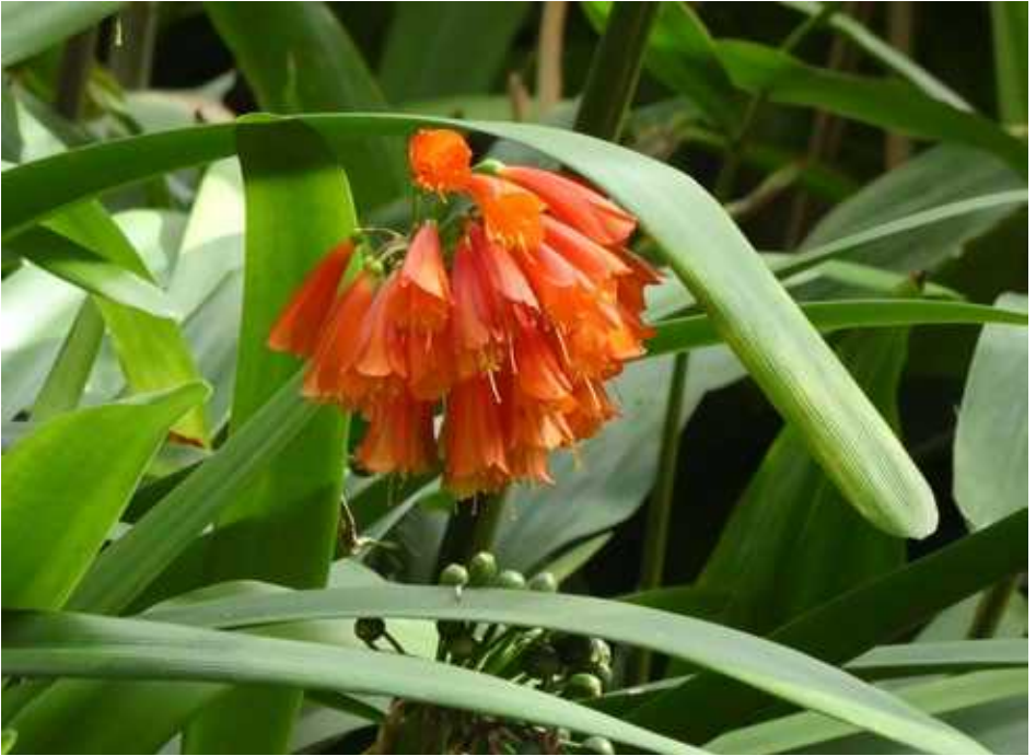
A typical pendulous variety.