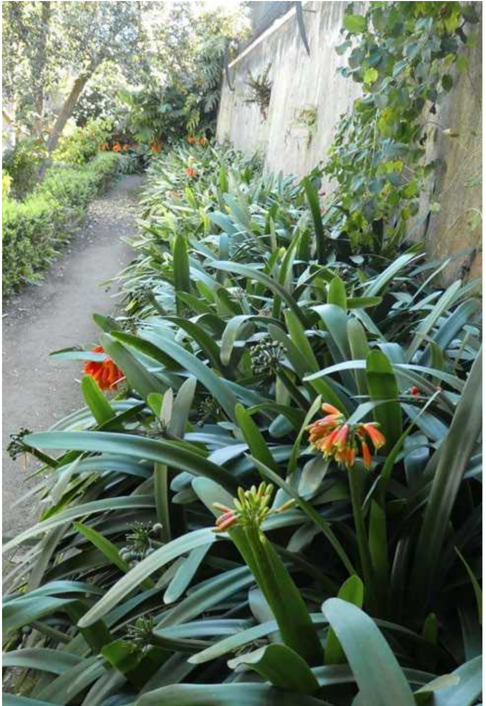
The pendulous forms with some having green tips.