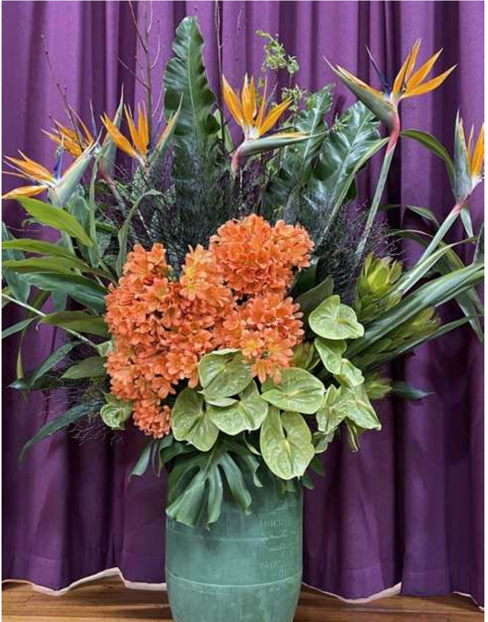
Figure 6 Floral Art 2022