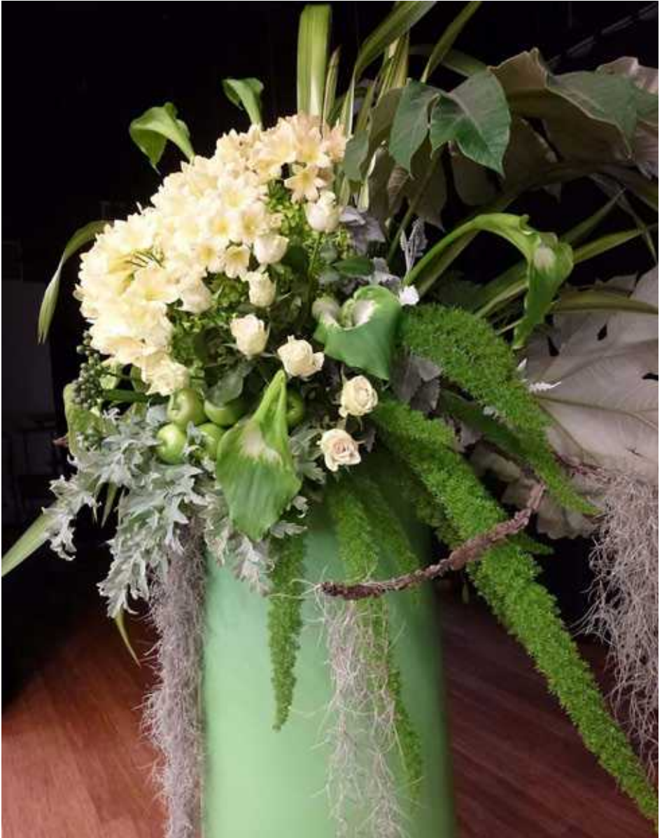
Figure 2 Floral Art 2016