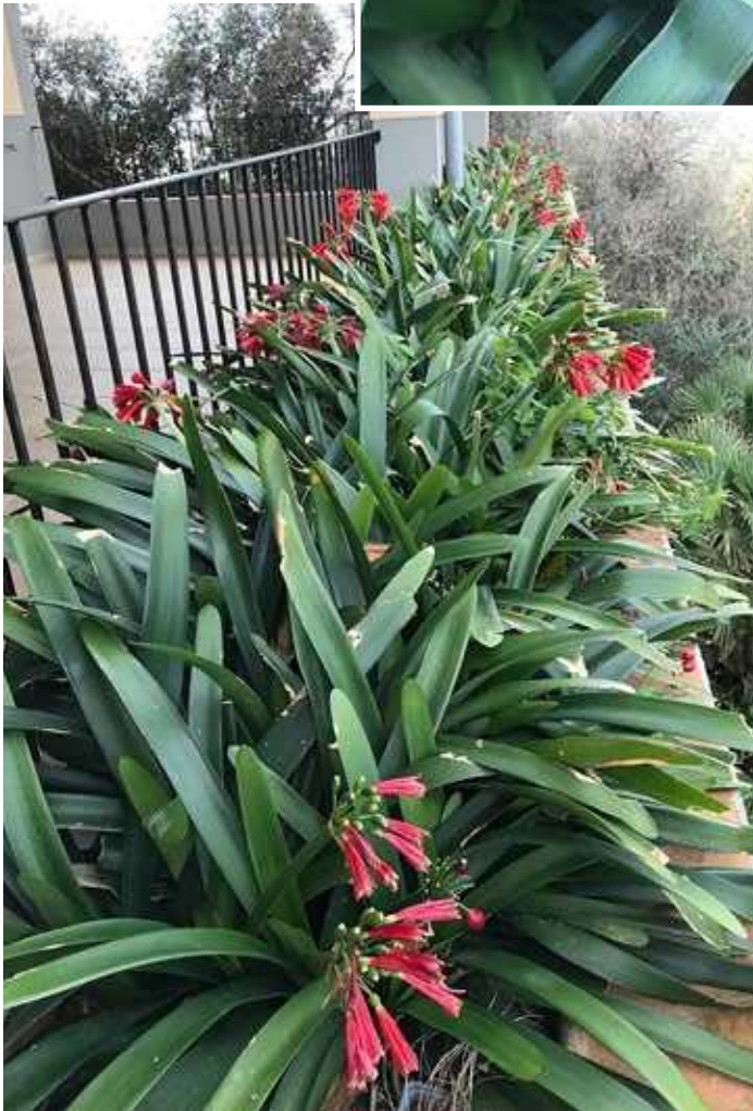
Majorca garden bed.

These clivia in Majorca, although they strongly resemble the nobilis species, may well be hybrids. I saw no evidence of miniata – like blooms on the island. One wonders how many other clivia species have found their way to Europe and other continents and have adapted to the local growing conditions? I know that the Botanical Gardens in Sydney have large beds of pendulous hybrids, possibly C. miniata X C. gardenii ? 🌺