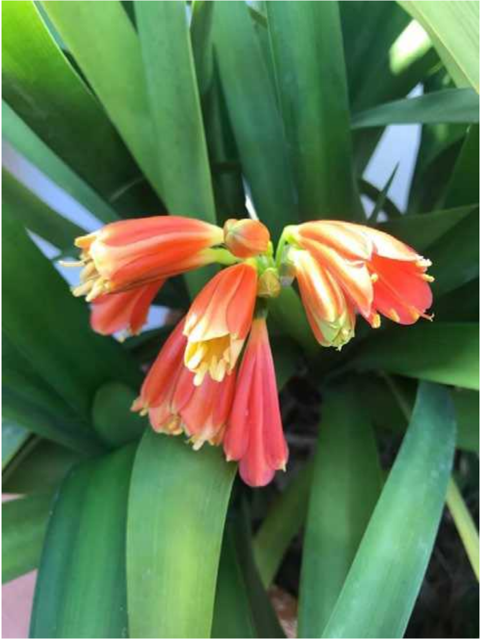
Variation in flower form in Majorca.

boxes and gardens in full sun in the town and vicinity. The flowers are pendulous and flower in the wet, cold winters from December to March. The leaves are tough and serrated but are not